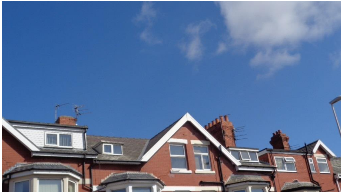
Differently designed roof lifts on a single terrace