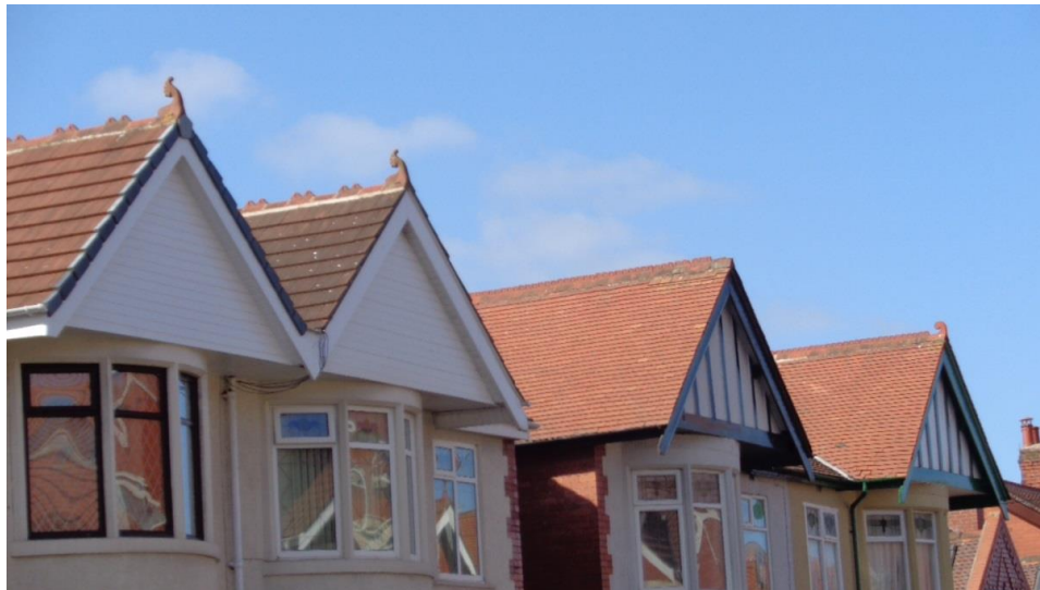
Original half-timbered gables to the right, upvc clad gables to the left