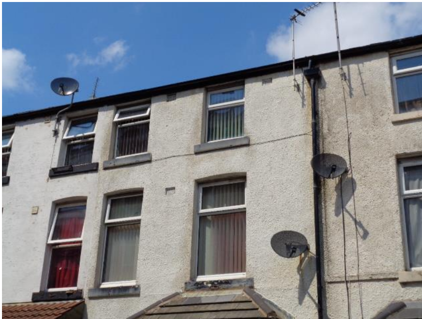
Insensitively positioned satellite dishes in Foxhall Conservation Area

Aerials, satellite dishes, CCTV equipment and alarm boxes can have a detrimental impact on the appearance of a house or building. Where possible they should be situated inside or to the rear of the property or carefully located to minimise the impact on the character of the house or building. Care must be taken when installing such features to avoid cable runs on the surface of brickwork, which can detract from the appearance of a house or building. They should be removed completely when no longer required.