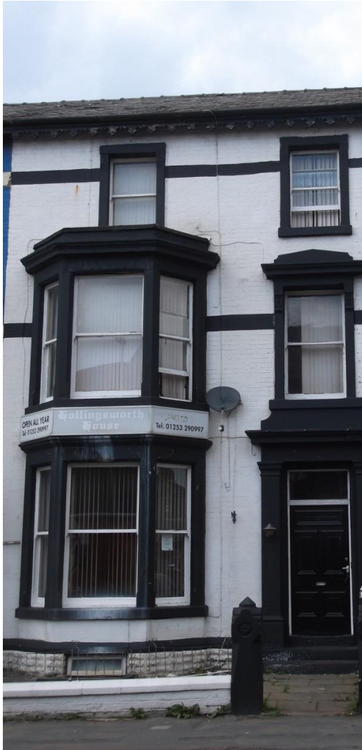
Guest house with original sliding sashes