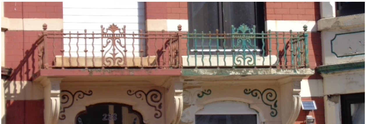
Wrought iron balcony railings

Original balconies and balustrades are important features and should be repaired and retained. Where they are missing they should be reinstated in appropriate materials whenever the opportunity arises.