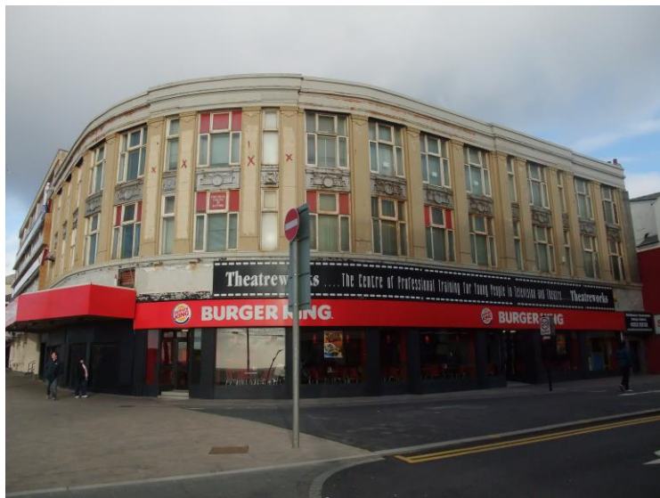
Burton's building 2014

When historic buildings are being redeveloped for a new purpose, past unsympathetic and inappropriate alterations should be reversed wherever possible in order to restore the character of the building.