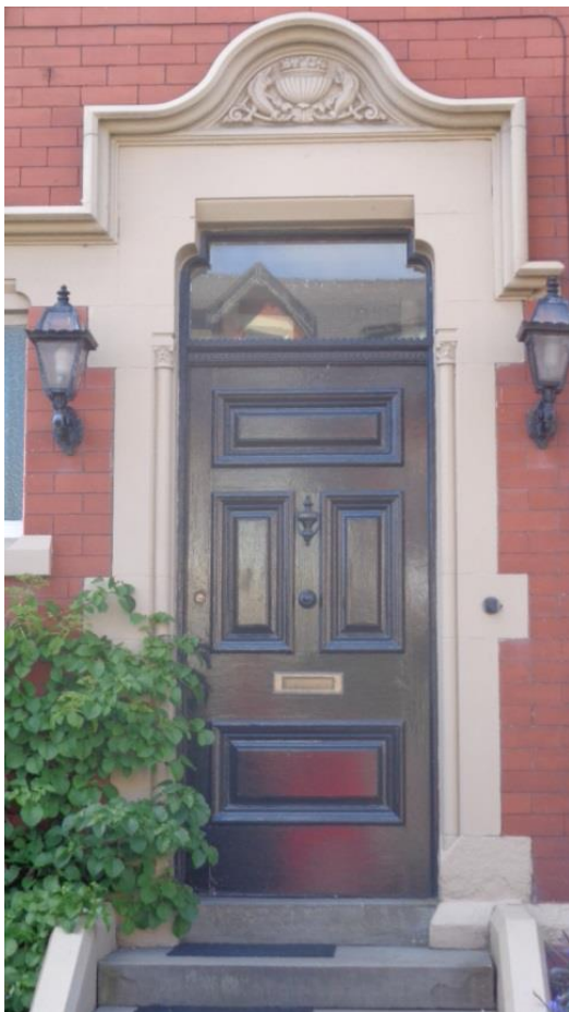
Original late Victorian panelled front door