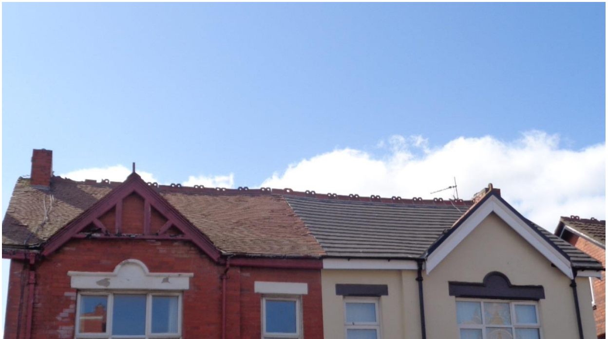
Red clay tile roof covering to the left and modern roof tile to the right of this pair of semi-detached villas