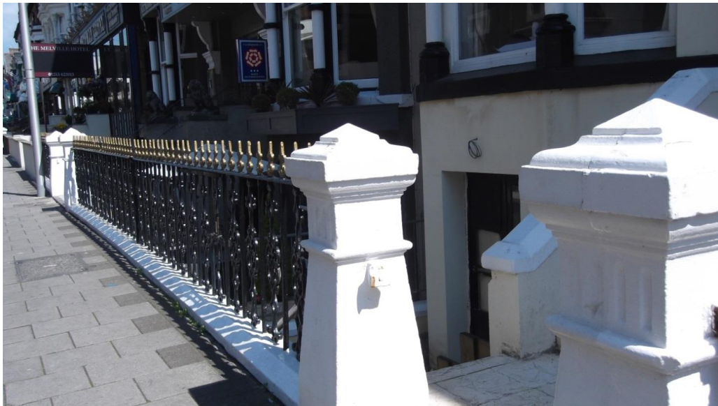
Wrought iron railings on Adelaide Street

Railings and other boundary treatments for commercial premises are not an historic feature in Blackpool's conservation areas, other than on historic boarding house streets. Replacement may be appropriate for railings removed in the past, but new railings will not usually be supported.