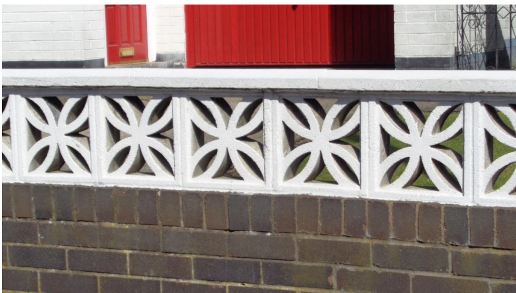
Modern decorative concrete block walling