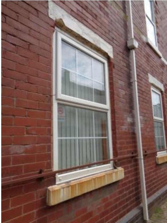
Upvc window frame with 'stick on' glazing bars and top hung upper window