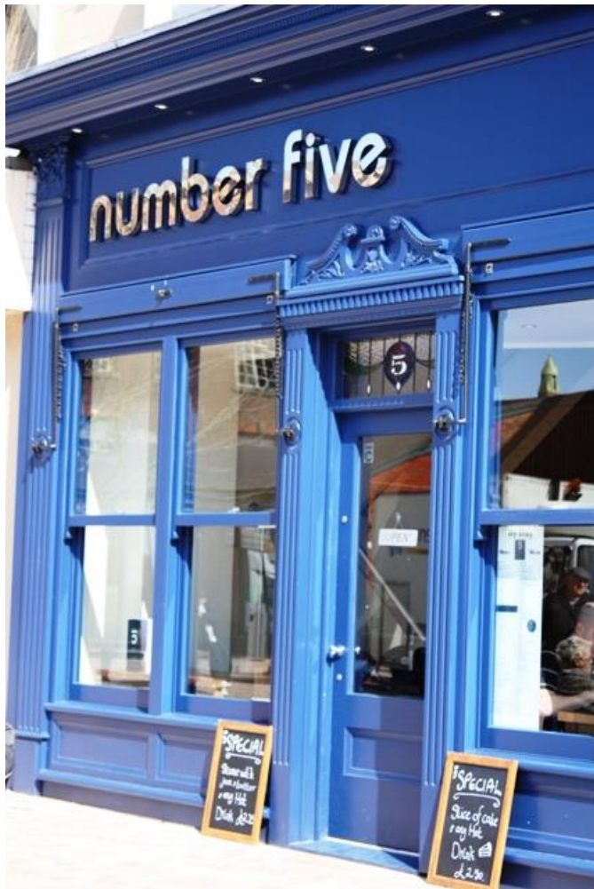
Traditional shop front on Cedar Square

Replacement shopfronts and signage should comply with SPG 6: Shopfronts and Signs. https://www.blackpool.gov.uk/Residents/Planning-environment-and-community/Planning/Planning-policy/Blackpool-local-plan/Supplementary-planning-documents-and-guidance/Supplementary-planning-documents-and-guidance.aspx . This SPG is supplemented policies CS7, LQ 11 and LQ13, and by further guidance which is available on the Council website.