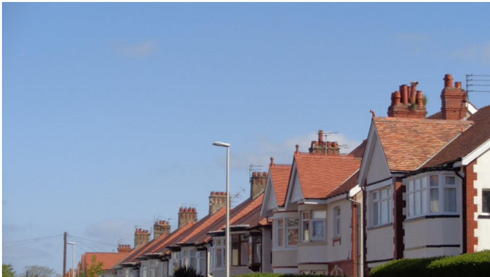
Chimneys in Raikes Hall Conservation Area