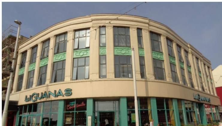
Burton's building 2017