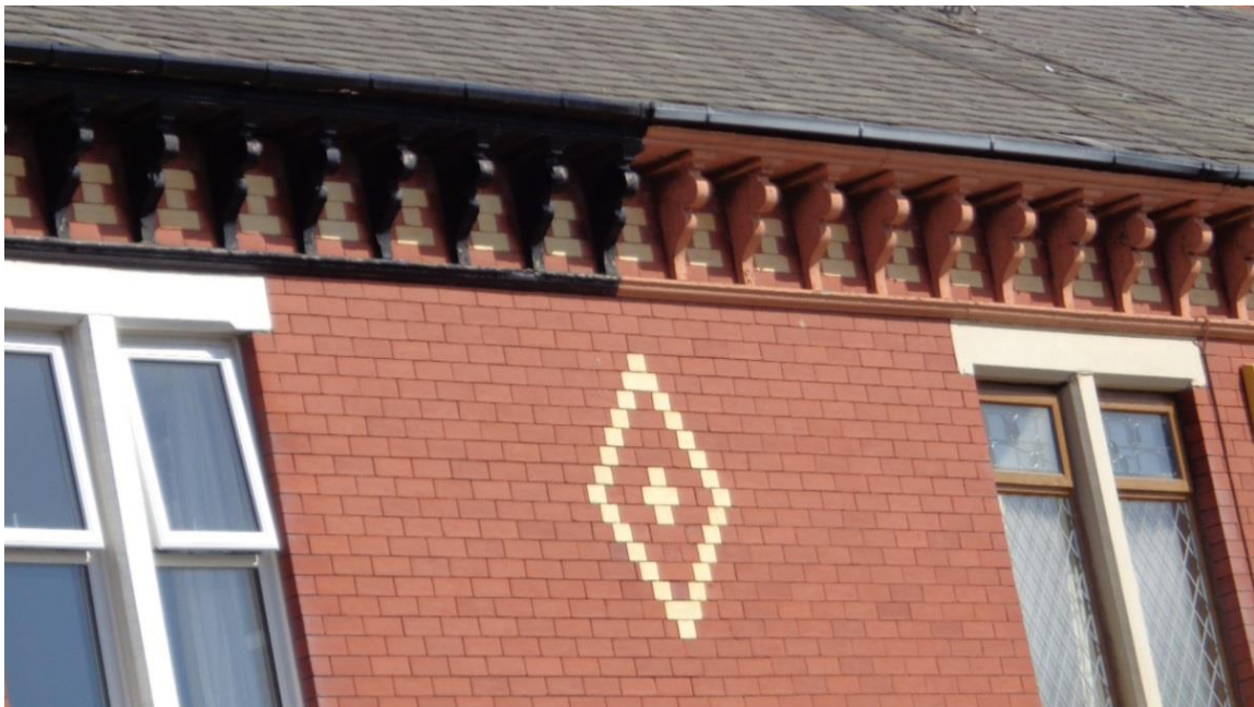
Decorative eaves brackets

Rainwater gutters and downpipes would originally have been cast iron on historic houses and buildings. If you have original cast iron rainwater goods these should be repaired and retained, or replaced with cast aluminium. If you are replacing existing upvc rainwater goods you may replace them with black upvc as a minimum.