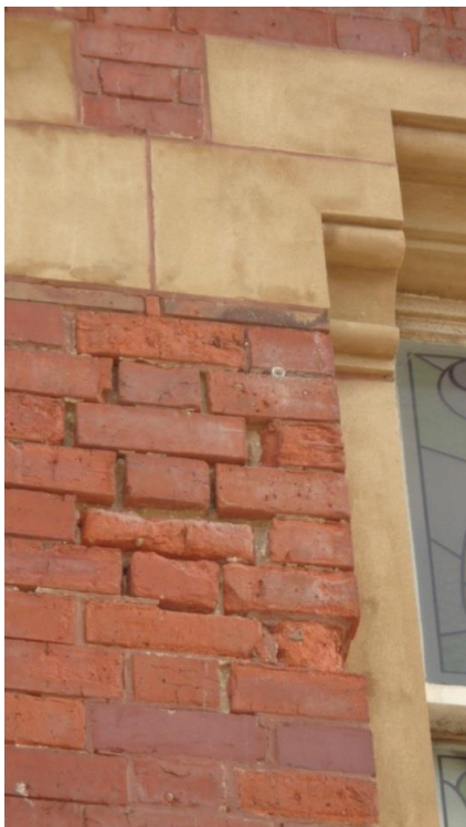
Late Victorian building repointed with cement mortar which has led to frost damage

Masonry which has traditionally not been rendered and/or painted should remain undecorated as painting masonry can be very damaging, and will undermine the character of the house or building and the wider conservation area. Where buildings have already been cladded, rendered and/or painted, advice should be sought from the Built Heritage and Conservation Team before repainting or other works are undertaken. Besides having a negative impact on character, rendering or painting historic masonry can cause damp issues internally.