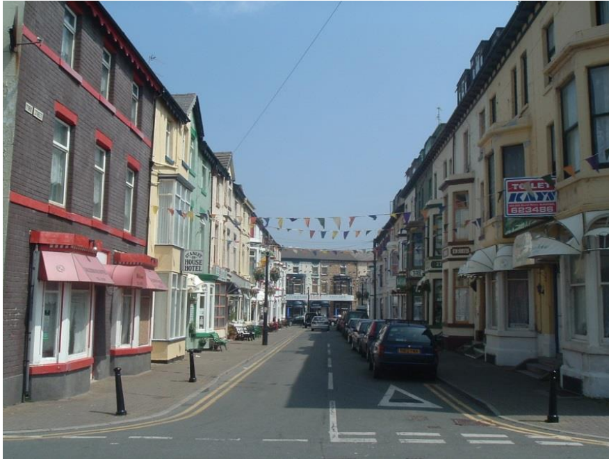
Modern fixed blinds on historic buildings