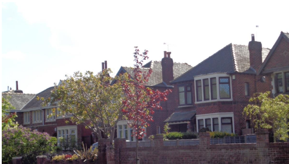
Chimneys in Stanley Park Conservation Area

Chimneys often make a major contribution to the character of a conservation area and should be repaired and retained. Planning permission will be required for their removal, and will require strong justification.